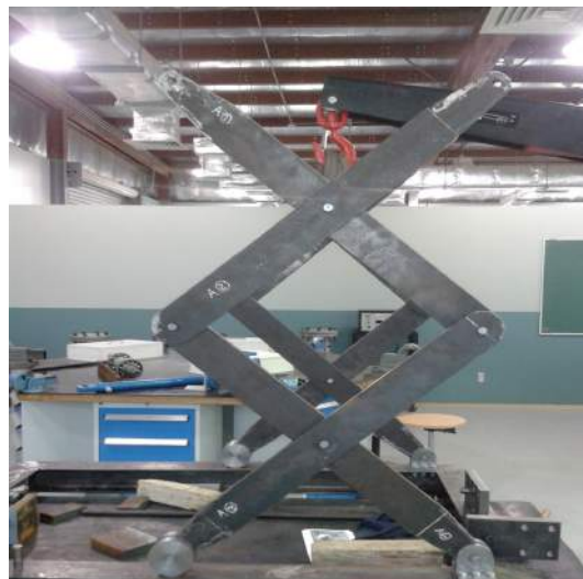
Figure 2 - Early fabrication and component fitting of the lift mechanism