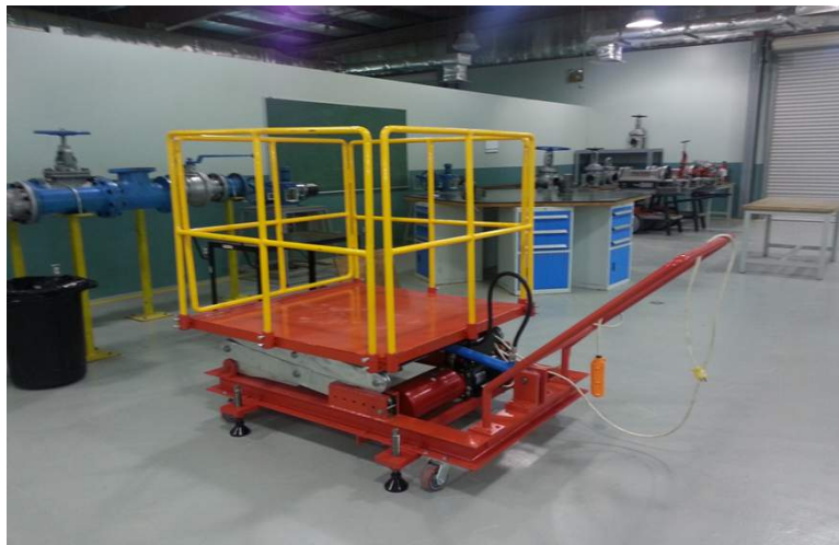
Figure 3 - The finished product

This project provided an excellent opportunity for JTI students to gain skills in teamwork, leadership, time management, and applied classroom knowledge to a real-world application that required a multidisciplinary team to complete.