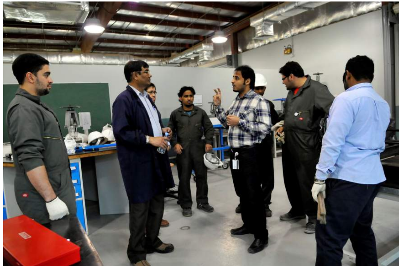
Figure 1 - Team Formation, the Welding Club evolves into the Mechanical Club

The club started off with small meetings and discussions about various projects. At the very first part of this project, students came up with unique ideas by the means of brain storming process. By the end of this brain storming session, the club finalized upon the project that they would work upon. Among all the concepts submitted, the club zeroed in on developing a hydraulically powered aerial